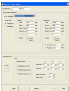
Step #1 Define input timing

Example VP9configure™ menus are shown below: