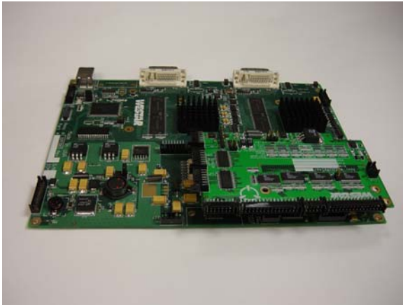
VP9 - Dual Channel Video Processor

The VP9 Dual Video Processing Module provides powerful Picture-In-Picture (PIP) and video mixing functions to drive a TFT panel in your display product, all on a single circuit card!