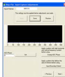
#5 Input Capture Adjust