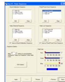
#6 Define Panel Power Sequence