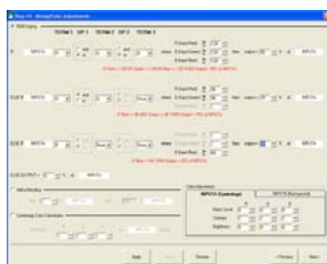
#4 Define Mixing and Color Adjust