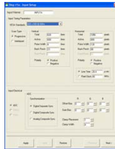
Step #2 Define output timing